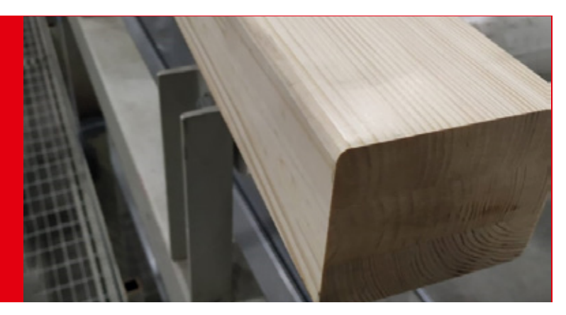
KVH (finger-joint) 7 000 cubic meters per month

glulam for timber constrictions, KVH (finger-joint), S4S (calibration timber), furniture panels, multi-layer panels (HDF*pine*HDF), wall moldings (it can be primed, painted or wrapped in waterproof paper. In this way all possible defects become invisible - the perfect surface for coloring), baseboard (MDF, pine).